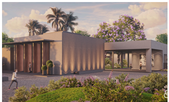
Ananta | Performing Arts Block