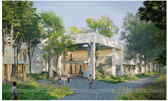
Nirmala | Learning Block