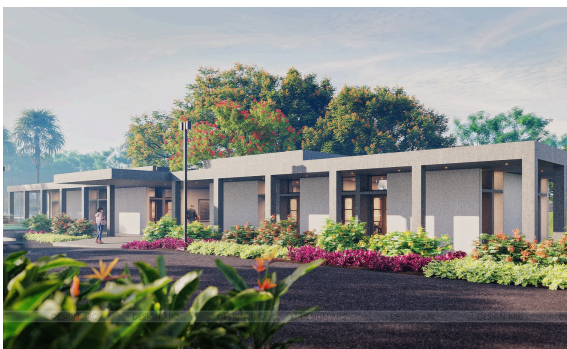
Nirvikara | Security Block