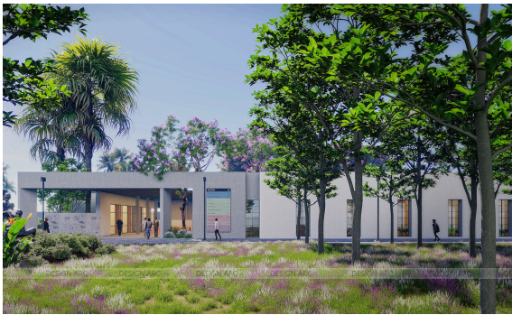
Ekam | Admin Block