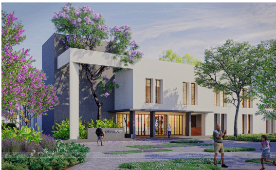
Aparoksha | Clinical Block