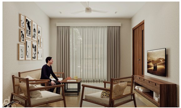
Student Living Area