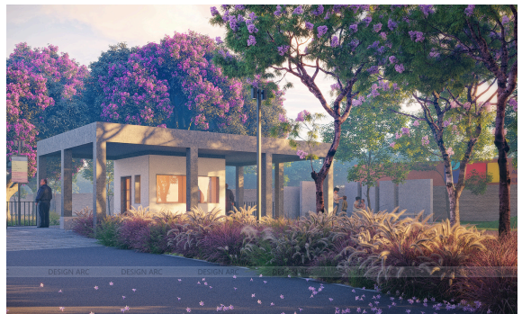
Avyaya | Guard House