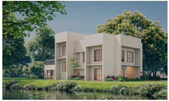
Parent's Housing - A Block