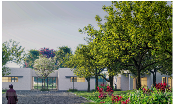
Shanta | Wellness Block