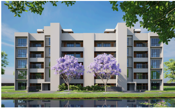
Parent's Housing - E & F Block